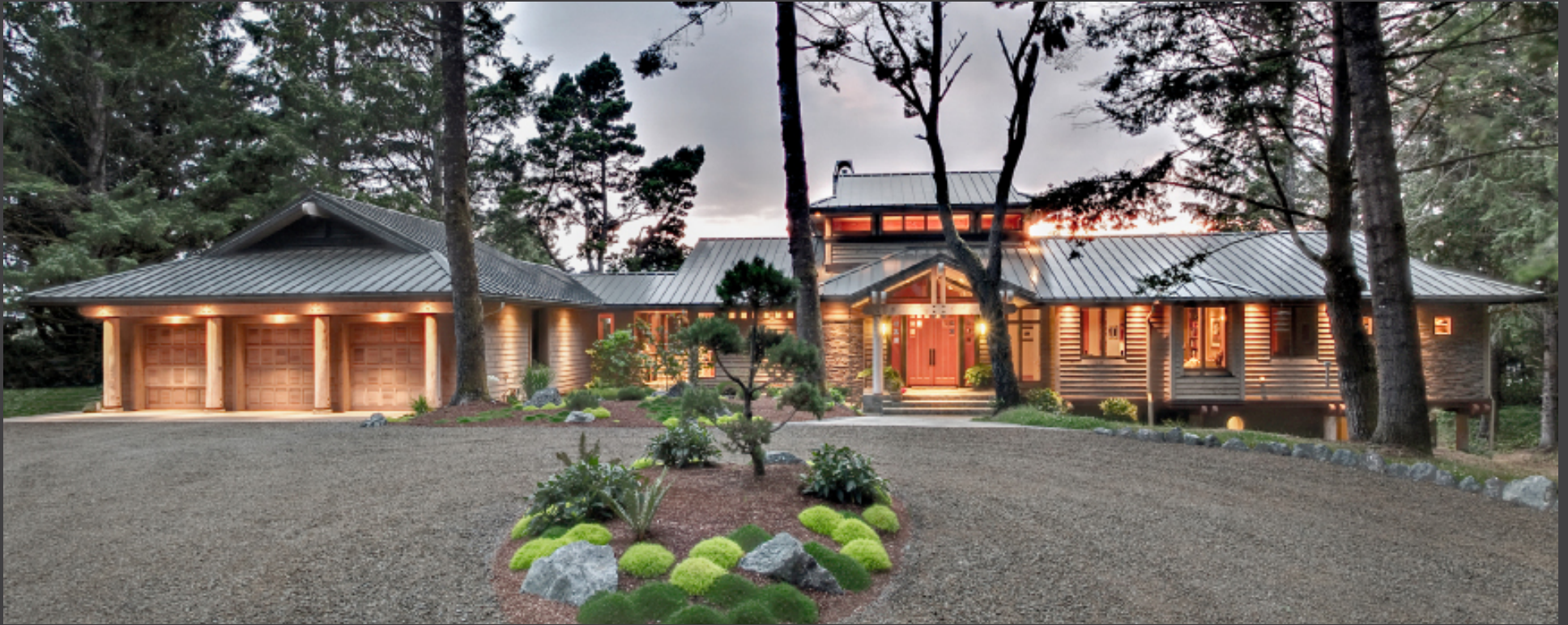
East Side - Main Entrance and Japanese Garden